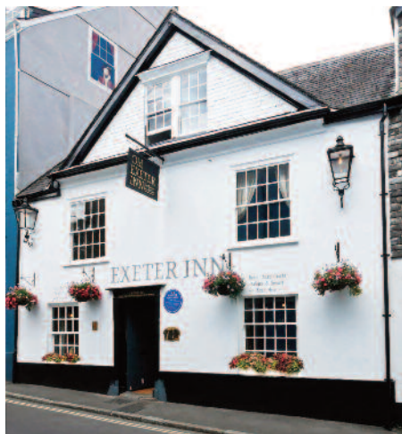
The Old Exeter Inn

The Old Exeter Inn at Ashburton is old as the name suggests and one can only wonder at what has really gone on in a building of this age. It is very likely to be the 5th oldest Inn in the United Kingdom. Built in 1130 a.d. to house the workers of St Andrews Church, directly opposite, the Exeter was originally known as the Church House Inn and these properties were used by the Church to raise funds by brewing and selling ale. It is also the oldest building in the beautiful ancient stannary town. It later changed its name to Exeter Inn when the principle patron of the region became the Bishop of Exeter.